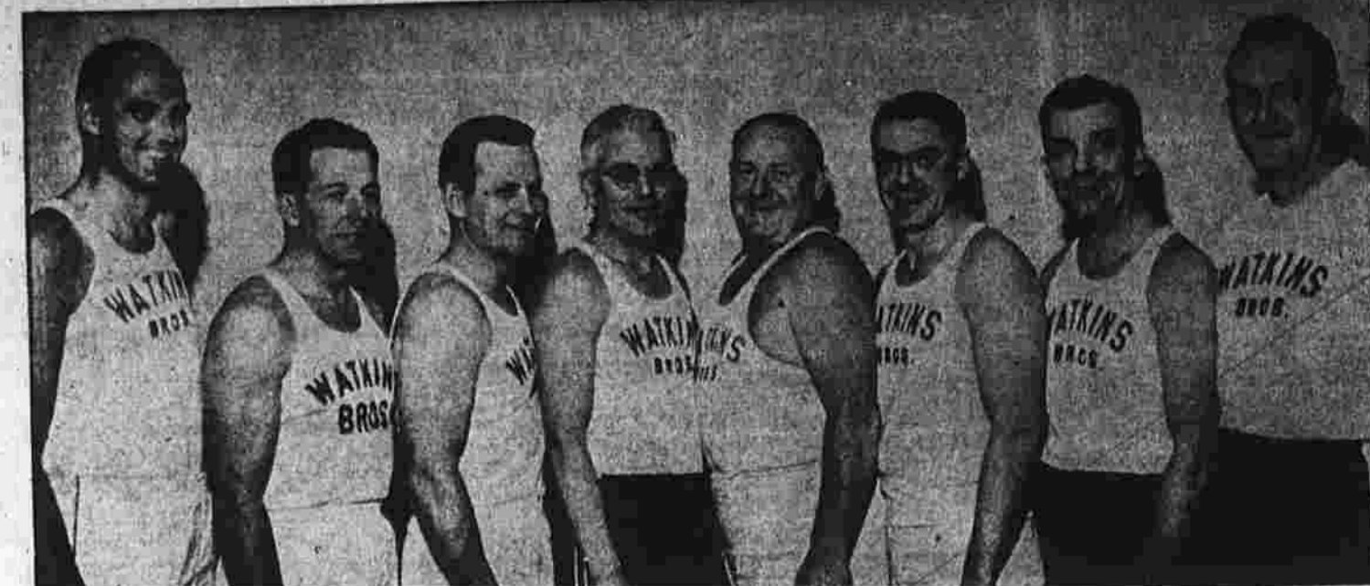
Watkins Championship Team Repeats in Rec Volleyball League. Repeat champions in the Recreation Department's American Volleyball League is Watkins Bros. Last night the Main St. sponsored team clinched honors for the 1959-60 season with a 3-0 win over Civitan. Watkins finished...