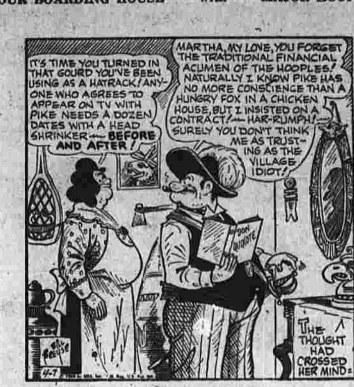
OUR BOARDING HOUSE